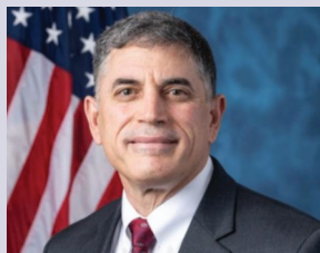
Rep. Andrew Clyde (R-GA)

Rep. Andrew Clyde (R-GA) and Senator Roger Marshall (R-KS) have introduced the SHORT Act—or Stop Harassing Owners of Rifles Today. Their legislation (H.R. 646, S. 163) will remove all regulations for SBRs, SBSs, and AOWs from the National Firearms Act, effectively eliminating half of the entire law. This is critical, since the ATF’s recent Pistol Brace Ban Rule is claiming the NFA is what gives them the power to do this rule. Listed here are the cosponsors for H.R. 646.