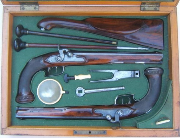
Ca. 1850s Howdah Pistol – with detachable stock

http://www.hallowellco.com/historical_gallery_antique%20guns.htm