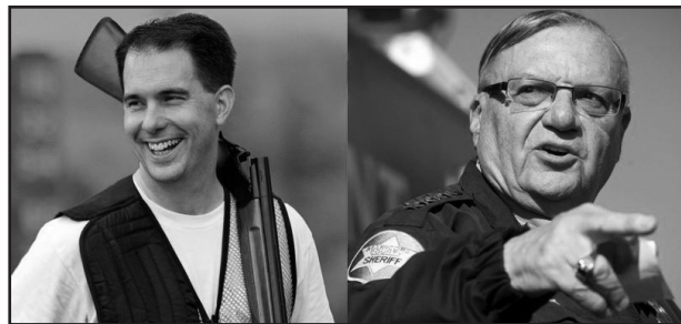
Wisconsin Governor Scott Walker (R) and Sheriff Joe Arpaio of Maricopa County, Arizona, have both taken steps to protect servicemen in their respective jurisdictions.

In a July 22 story in Stars and Stripes , readers were astonished to see this headline: "Army to Recruiters: Treat Armed Citizens as Security Threat."