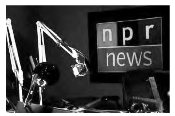
"Gun Owners of America showed with one email alert that it could help flood the phone lines on Capitol Hill days before the Senate vote." — National Public Radio, December 26, 2013

But it's GOA's grassroots activists who should really be proud, because without them, we could never have accomplished all that we have done in defense of America's gun rights.