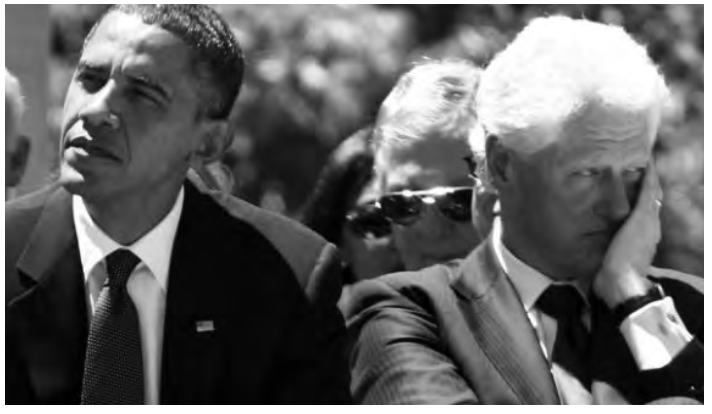
Presidents Obama and Clinton have complained about the power of the "gun lobby" in recent months and the ability of our grassroots to "intimidate a lot of senators" into opposing gun control.

of America and its activists for the defeat of the President's gun control agenda.