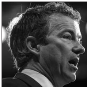
Senator Rand Paul (R-KY)