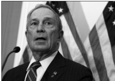
Anti-gun former Mayor Michael Bloomberg is now pushing amnesty for illegals — an obvious ploy to get more anti-gun Democrats elected.

efforts to stop an anti-gun immigration amnesty bill in Congress.