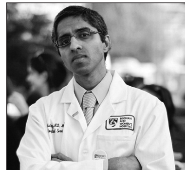
The liberal media have lamented the pressure that groups like GOA have put on Obama's anti-gun pick for Surgeon General.

Democrats are now considering voting against this Surgeon General nomination. ■