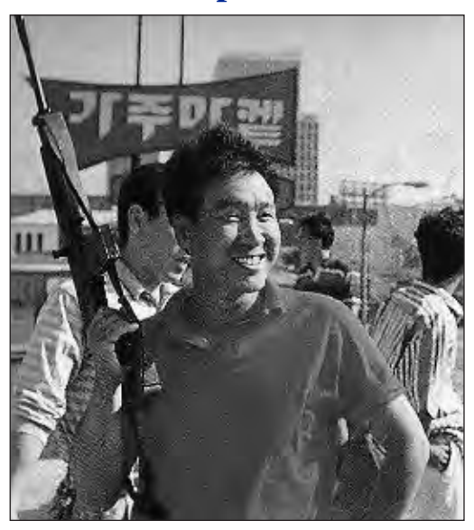
How about the Korean merchants who protected their stores during the Los Angeles riots of 1992. Their stores remained standing while others burned to the ground when the police and National Guard refused to go into the danger zones and left citizens to fend for themselves.

this really the road we want to travel, where our God-given rights are no longer considered inalienable?