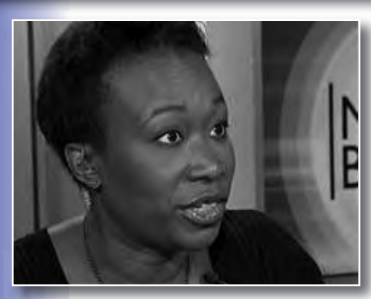
The reason the NRA is moving to the right is to counter "more extreme groups like Gun Owners of America."