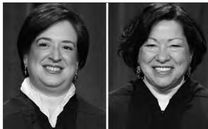
The President's reelection means that he will have a huge impact upon the direction of our country for years to come. In addition to already adding two Supreme Court Justices (pictured above), Obama has had 160 federal judges confirmed by the Senate to lifetime appointments.

GOA is working with conservatives in the Senate in an attempt to preserve the filibuster, and strategizing with both House and Senate members on how to keep Obama and the Congress from further eroding the Second Amendment. ■