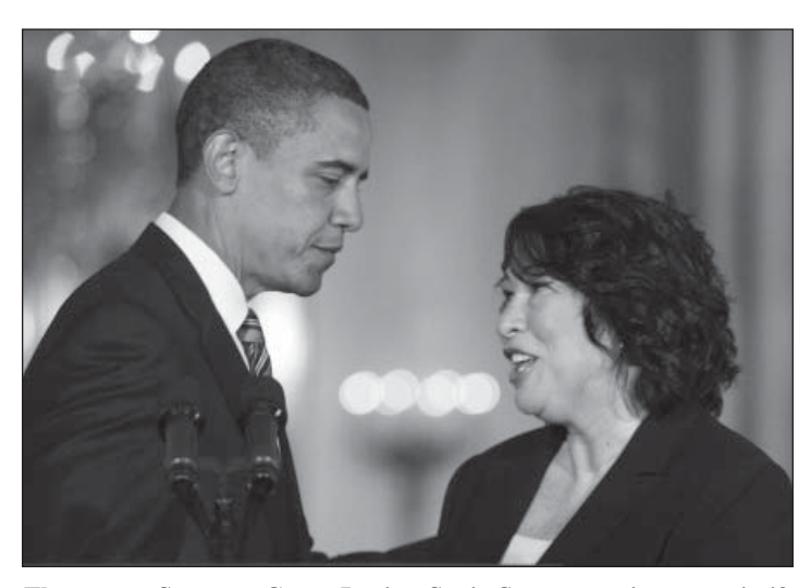
The newest Supreme Court Justice, Sonia Sotomayor, is uncertain if Americans have a fundamental right to self-defense and ruled that a state ban on all firearms would be constitutional.

Reid now preside over large majorities, but those majorities are expected to diminish (if not disappear completely in the House) after the 2010 elections. It is likely that they will attempt to cram gun control down gun owners' throats as the prospect of a more evenly divided Congress looms ahead.