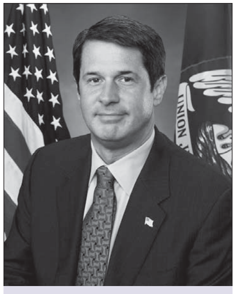
"GOA has led the national gun rights organizations..." — Sen. David Vitter (R-LA)