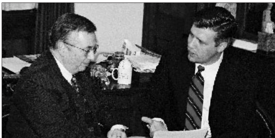
A huge chunk of Bill Clinton's gun control legacy was repealed at the beginning of this Congress when HUD Secretary Mel Martinez (left) announced that his department will "no longer participate" in lawsuits against the gun industry. GOA played a crucial role in this effort by helping Indiana Rep. John Hostettler (pictured on the right) get 99 additional Congressmen to sign his letter asking Secretary Martinez to pull the plug on these dangerous lawsuits which threaten to cripple the gun industry and, thus, endanger the ability of decent Americans to purchase new firearms.