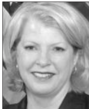
Marilyn Musgrave (R-CO) was elected to the U.S. House of Representatives in November. As a state senator, she led the fight for Vermont-style carry.

In addition, the D.C. area sniper attacks dominated the news in the weeks leading up