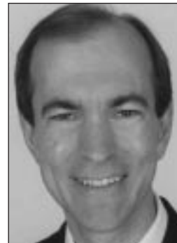
New Jersey voters elected to send pro-gun Scott Garrett (R) to replace the anti-gun Marge Roukema.