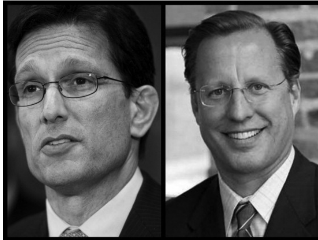
College professor Dave Brat, right, supported by GOA, defeated House Majority Leader Eric Cantor in a stunning primary upset.

mary in Nebraska and is heading into November with great momentum behind his campaign. He is a stalwart defender of the Second Amendment.