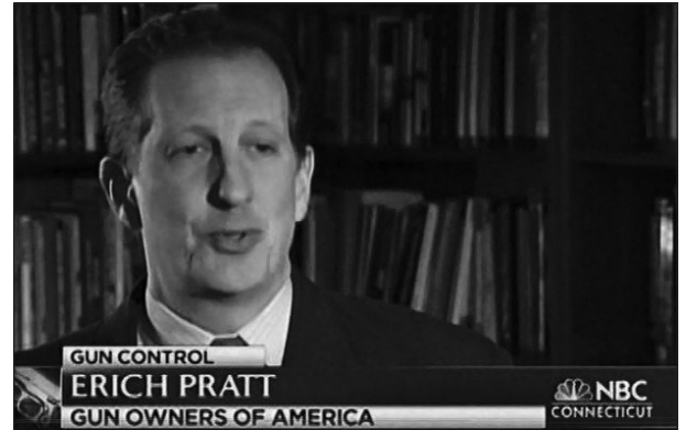
Gun Owners of America has been making the case that Michael Bloomberg faces an uphill battle, given that a majority of Americans — as indicated in a recent Gallup poll — do not want stricter gun control.

lic, he should consider passages like I Samuel 13:16-22, where arms control was considered a curse; and Luke 22:36, where Jesus told His disciples to sell their cloaks and buy a sword (if they didn't already have one).