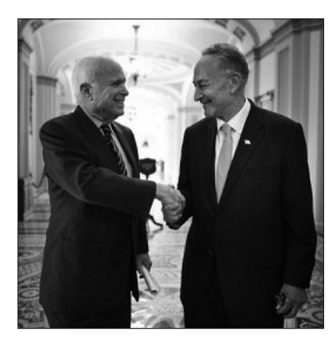
While every Senate Democrat (including Chuck Schumer on the right) supported the anti-gun amnesty bill in June, another 13 Republicans followed Senator John McCain's lead in voting for the bill.