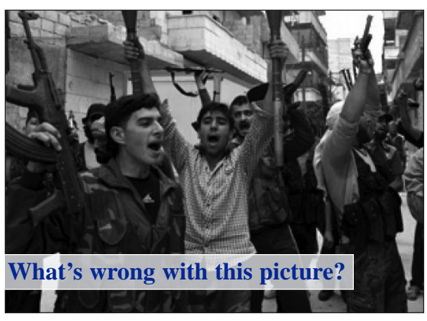
Our President is willing to send weapons to Syrian rebels with possible terrorist connections, but he won't trust Americans with semi-automatic rifles.

But by framing the gun control argument around the government keeping people safe from all potential dangers,