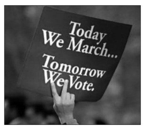
The amnesty bill is about legalizing more than 8 million anti-gun voters from a demographic that supported Obama in 2012 by 71 percent.

But it's not just those living in the Golden State who have been affected.