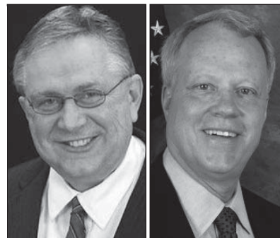
Reps. Steve Stockman (R-TX) and Paul Broun (R-GA)

Mark Meadows (R-NC) Luke Messer (R-IN) Markwayne Mullin (R-OK) Steve Pearce (R-NM) Trey Radel (R-FL) Martha Roby (R-AL) Todd Rokita (R-IN) Keith Rothfus (R-PA)* Matt Salmon (R-AZ) David Schweikert (R-AZ) Steve Stockman (R-TX) Marlin Stutzman (R-IN) Randy Weber (R-TX) Brad Wenstrup (R-OH) Ted Yoho (R-FL)