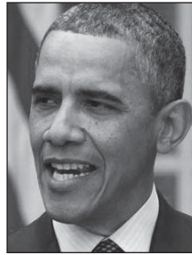
President Obama was visibly shaken in April when his gun control agenda failed in the Senate, but he has vowed to continue pursuing for its passage later this year.

ators Rand Paul (KY), Ted Cruz (TX) and Mike Lee (UT) — and their entire staffs — deserve your thanks. These three Senators led the filibuster and forced Obama & Co. to expend much capital in simply getting Reid’s gun control bill to the floor.