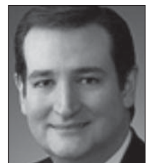
Ted Cruz (R-TX)

Mark Pryor (D-AR) James Risch (R-ID) Pat Roberts (R-KS) Marco Rubio (R-FL) Tim Scott (R-SC) Jeff Sessions (R-AL) Richard Shelby (R-AL) John Thune (R-SD) David Vitter (R-LA)