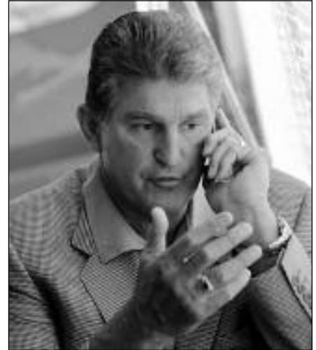
In his first gun-related vote, Senator Joe Manchin (D-WV) voted against repealing ObamaCare. Those interested in seeing how their Representative and Senators voted on the odious health care law can do so at: http://tinyurl.com/6yfaqu