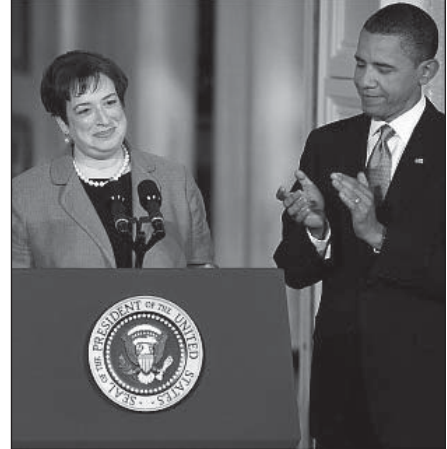
Obama favorite Elena Kagan has lamented that socialism "never attained the status of a major politicial force" in the U.S.

And according to Politico.com (March 20, 2009), she says that foreign law can be used to interpret the U.S.