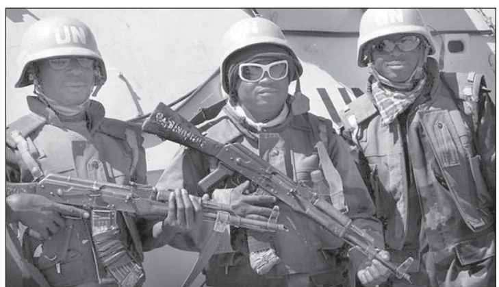
If the Obama administration gets its way, Americans could see an international gun control treaty imposing licensing restrictions, bans on most semi-automatic firearms, an end to private sales at gun shows, and much more.

Nations directly enforcing compliance. As noted by the Heritage Foundation, the International Criminal Court could be "an alternative avenue of enforcement."