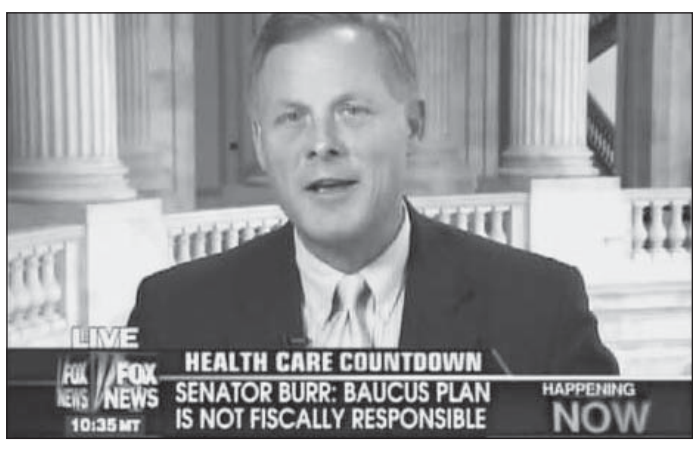
A vocal opponent of the ObamaCare legislation, Sen. Richard Burr (R-NC) has also sponsored a bill to protect veterans' Second Amendment rights.

The federal Department of Veterans Affairs (VA) oversees the