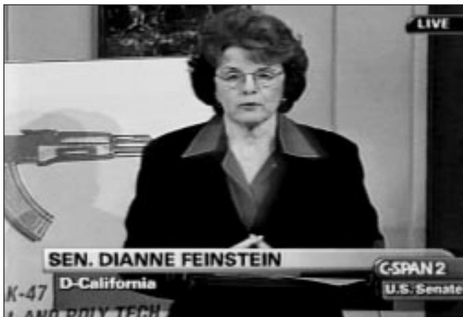
Democrat Senator Dianne Feinstein of California has promised to renew the fight next year to reinstitute the ban on certain magazines and semi-automatic firearms.

To combat this, GOA worked hard to get Senate Majority Leader Bill Frist to use parliamentary maneuvers to keep gun control amendments from being