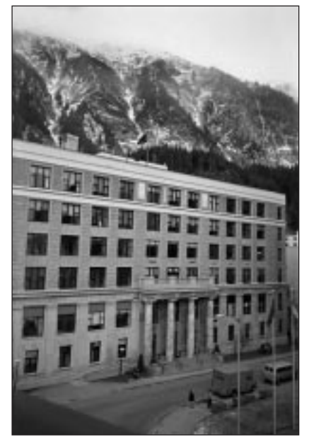
The Alaska state capitol in Juneau. GOA mobilized grassroots activists in the state as legislators were debating a bill to let citizens carry firearms without a permit. The legislation passed by overwhelming margins in both houses, and was signed into law in June.