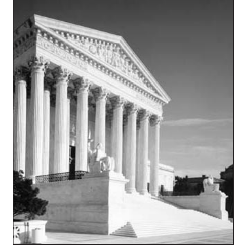
Gun Owners of America, along with a group of other plaintiffs, has gone to the Supreme Court to challenge the constitutionality of election laws that squelch GOA's ability to use radio or television to hold legislators accountable for their voting record. During oral arguments before the Court in September, several of the Justices revealed they were familiar with GOA's written brief as they used GOA's arguments to poke holes in the government's case.