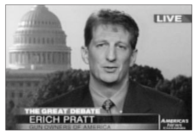
"Even though it does not attract headlines as the NRA does, Gun Owners of America is regarded as a key player [on Capitol Hill]." -- The Hill newspaper, October 29, 2003

caused him to lose three pro-Democratic and pro-gun states (Tennessee, West Virginia and Arkansas). It was only then that the lesson finally sunk in for many top-level Democrats.