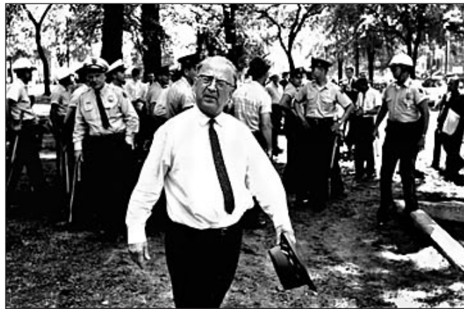
Birmingham Police Commissioner Bull Connor (pictured above) was known for his heavy-handed tactics. NSC adviser Condoleezza Rice (upper right) says she opposes gun control because of people like Connor, who could have used registration to confiscate guns from the southern blacks who were oppressed by the KKK in the 1950s and 1960s.