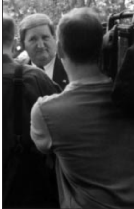
Senator Bob Smith speaks to reporters in July.