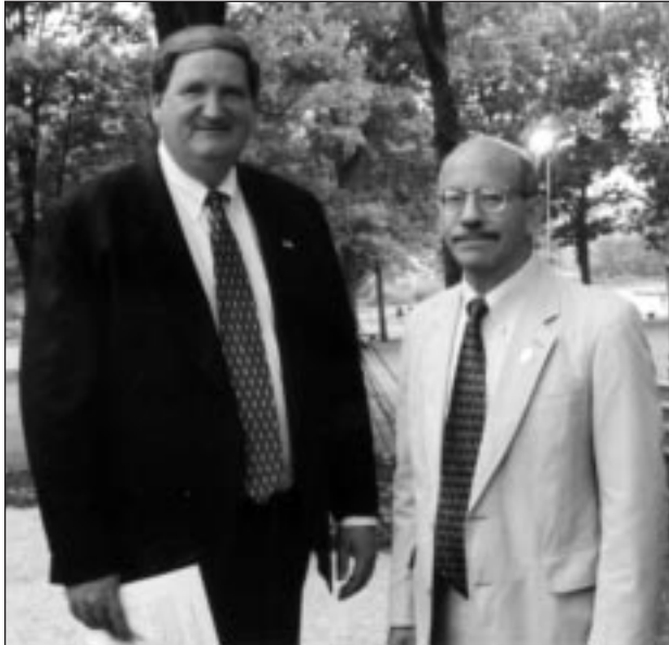
House and Senate sponsors of legislation to arm pilots take a moment to pose for the camera. From left to right, they are Republican Senator Bob Smith of New Hampshire and Democratic Representative Peter DeFazio of Oregon.