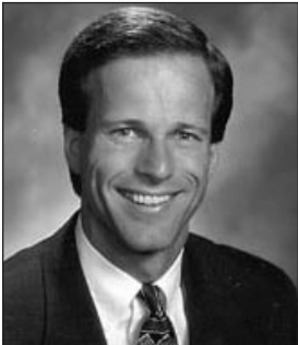
Pro-gun Rep. John Thune (R-SD)

Senator Smith, the Senate sponsor, put it this way: “An armed pilot is the airplane’s first line of deterrence and the last line of defense.” ■