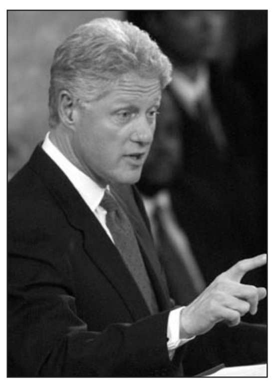
In his State of the Union message in 1995, President Clinton admitted that several House Democrats lost their seats in the '94 election after having voted for the semi-auto ban.

Of course, the truth is Sen. Feinstein would prefer to do more than simply extend the ban, but rather make it permanent and retroactive. As the elitist Senator said on 60 Minutes in 1995, "If I could have gotten 51 votes in the Sen-