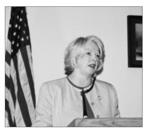
Colorado Representative Marilyn Musgrave has been one of the chief forces bringing the Second Amendment Caucus together on Capitol Hill. The caucus is made up of more than four dozen Congressmen who are dedicated to repealing federal gun control legislation. (See page 3 of the June 28, 2004 issue of The Gun Owners for more information on the Second Amendment Caucus.)