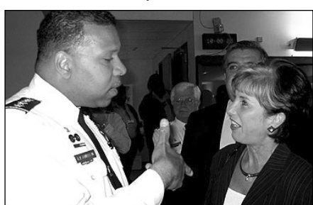
In September, New Orleans Police Commissioner Ed Compass stated, "No one will be able to be armed. Guns will be taken. Only law enforcement will be allowed to have guns."

Not only do law-abiding citizens with guns deter many criminals from committing a crime to begin with, possessing a gun is the safest way to confront a criminal if you are forced to.