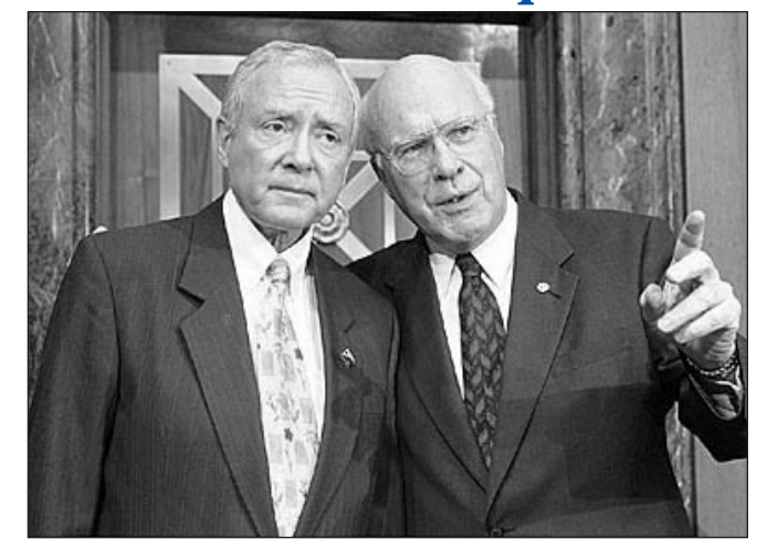
While originally intended to target the Mafia, the RICO Act has been used by federal prosecutors to go after peaceful political demonstrators. Republican Senator Orrin Hatch of Utah (left) even tried to expand the law in 1998 to cover gun dealers who committed minor infractions.