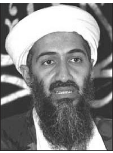
The PATRIOT II bill would do little to catch real terrorists like Osama bin Laden, but rather, would stifle the constitutional rights of law-abiding Americans.

The government could bug, wiretap, or search anyone in America for up to 15 days without going to any court if