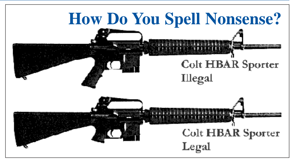
The Clinton-Feinstein ban outlawed the manufacture of the above firearm, but not the bottom one. The only difference is the grip.

But Clinton was right about one thing. Many Democrats lost their jobs