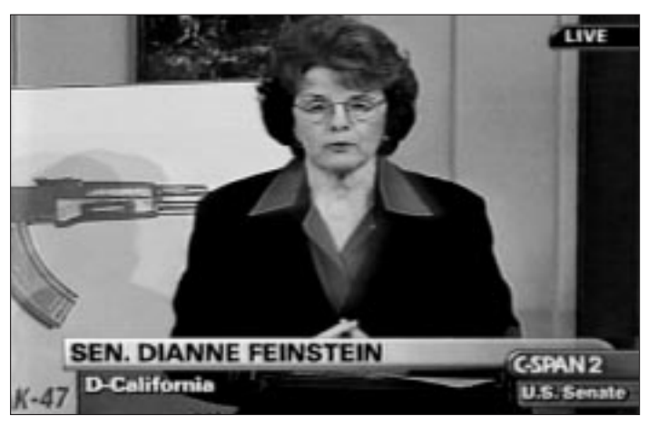
Senator Dianne Feinstein (D-CA)

Remember, you always kill a poisonous snake the first chance you get. One can only assume that a conference committee will "take care of the problem" if one ignores the determination of Ted Kennedy, Dianne Feinstein and Chuck Schumer.