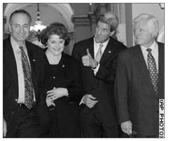
The "Three Amigos" of gun control pose with Democratic presidential contender John Kerry (second from right) after the semi-auto ban initially passed the Senate. The prohibition died moments later when the underlying bill was defeated, thus killing all the gun control amendments with it.

On March 2, Senators almost unanimously agreed to kill the bill (90-8),