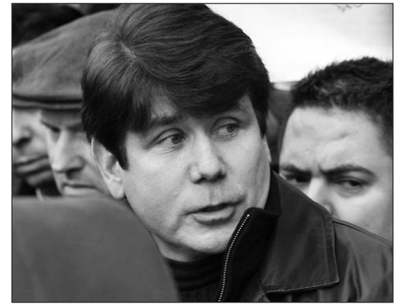
The media "gets it" when a sitting governor — like Rod Blagojevich (D) — tries to get some newspaper editors fired, but they don't seem to mind when it's gun owners' rights that are getting trampled.

Blagojevich who, even though he owned a state issued Firearm Owners ID card, did everything he could to restrict the ability of average citizens to own guns?