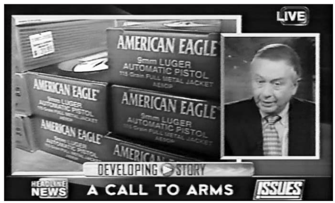
Gun owners' fear of increased Second Amendment restrictions has resulted in runs on ammunition — and hence, shortages — in several states.

Criminal penalties of up to ten years and virtually unlimited