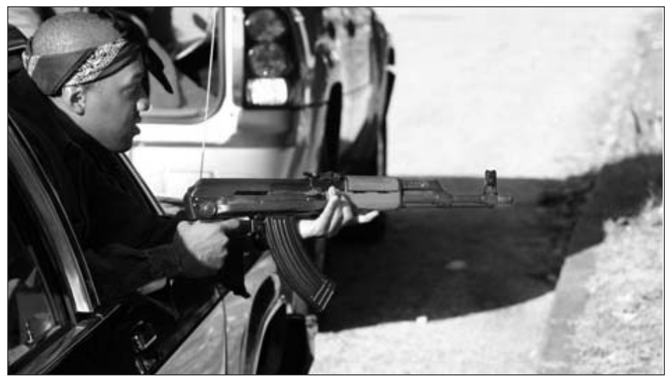
The National Geographic Channel portrayed twelve times as many negative uses of guns as positive uses — even though in the real world, guns are used at least 50 times more often to save life than take life.

2. Guns in America overstated the number of children who die by unintentional gunfire. In fact, when you look at the statistics involving younger children (ages 0-14), one sees that kids have a greater chance of dying from choking on things like the peanut butter and jelly sandwiches that you feed them.(2) Hmm, why doesn't National