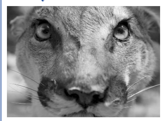
But the Interior Department doesn't want you carrying a gun when camping with your family. They say doing so will only "exacerbate" encounters with dangerous animals!

law should they drive the Parkway with a firearm.