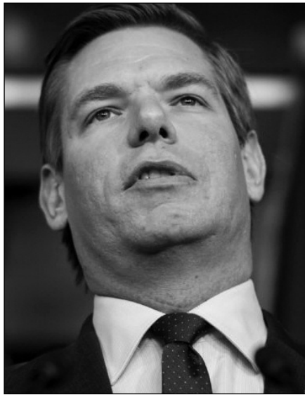
Rep. Eric Swalwell (D) wants to confiscate certain commonly-owned firearms from law-abiding Americans.

Nevertheless, residents who had been in lawful possession of the newly-banned firearms were required to sell