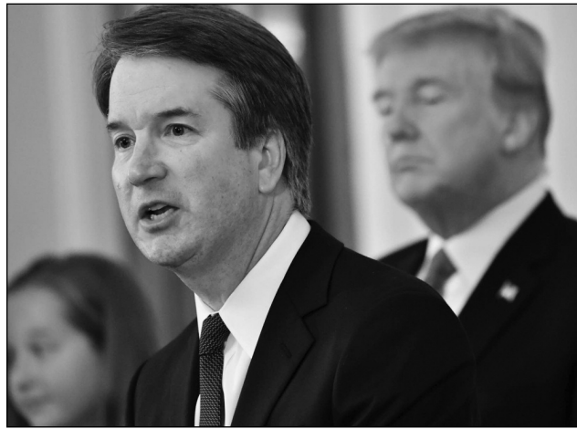
President Trump has nominated Brett Kavanaugh for the U.S. Supreme Court.

Such rulings are what led Connecticut Senator Chris Murphy to wail that "Brett Kavanaugh is a true Second