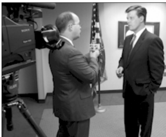
Pro-gun Rep. John Hostettler (R-IN) speaks before the TV news cameras.

Rep. Hostettler models his legislation on Article IV of the U.S. Constitution, which provides that "Full Faith and Credit shall be given in each State to