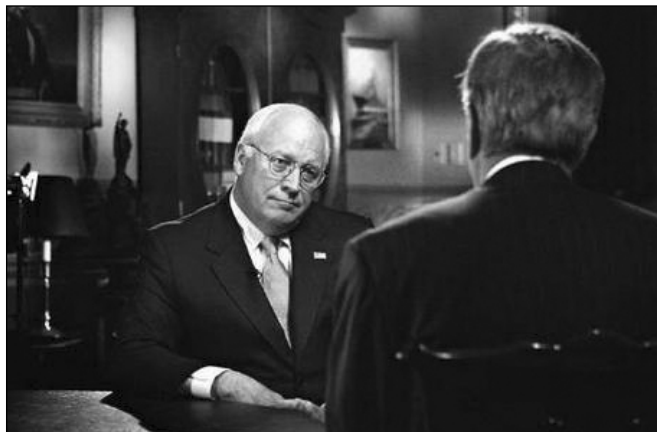
Vice President Dick Cheney appeared on Fox Cable News with Brit Hume in February to discuss his hunting mishap.

One reporter asked if Gun Owners of America was not afraid that the Cheney incident would lead to a call for more gun control. I explained the facts above about declining accidental firearms fatalities. He responded that, "Didn't we