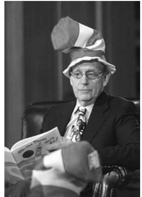
U.S. Supreme Court Justice Stephen Breyer has looked to other countries to find justification for his opinions.

Incorporation is now being expanded by a majority (six of the nine justices) of the Supremes to allow for foreign law as a guide to their judicial lawmaking. When the Court recently overturned capital punishment for an 18-year old who had cold-bloodedly mur-